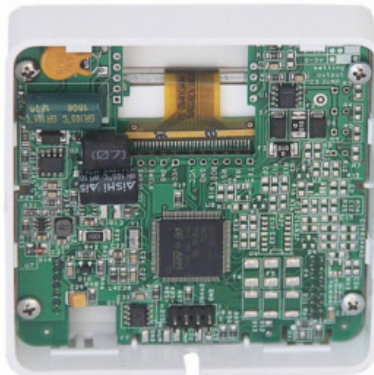
Rear of device